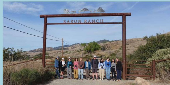
Birding is a popular activity at Baron Ranch on the Gaviota Coast.