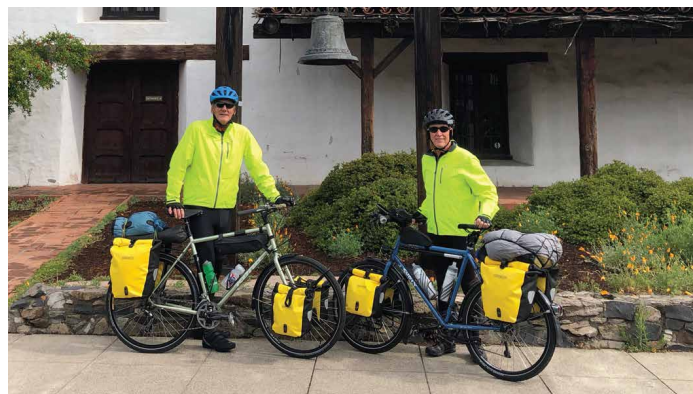
Cycling the California Missions Trail through Santa Barbara County and beyond.

Or visit our website to make an online donation http://sbtrails.org/donate