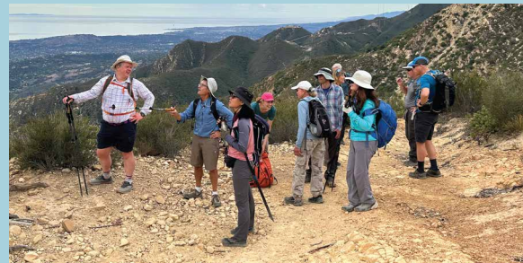
Guided hikes are led by Trails Council members to scenic locations.