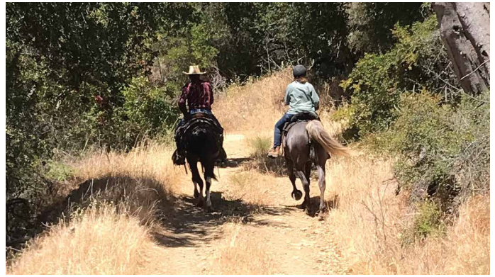
Following the Arroyo Quemada Trail at Baron Ranch on the Gaviota Coast.

Midland School Trails: Nestled in the foothills of the San Rafael Mountains, the ten-mile-long trail network is one of the few trail systems in Santa Ynez Valley that is